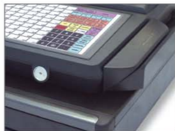
The SPS-500 Series has Magnetic Dallas & (Optional) Mag Card Reader.