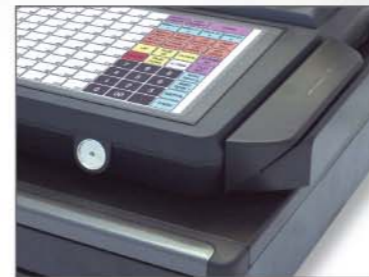
■ The SPS-500 Series has Magnetic Dallas & (Opt.) Mag Card Reader.