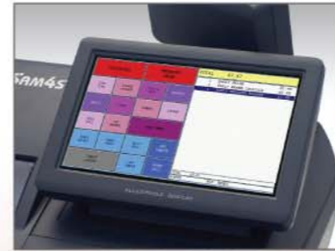
■ The SPS-500 Series has a 7" Touch Screen Operator Display.