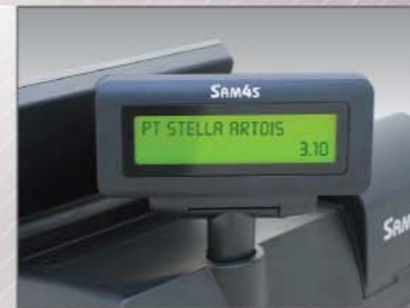
■ The SPS-500 Series has an adjustable Rear Customer Display.