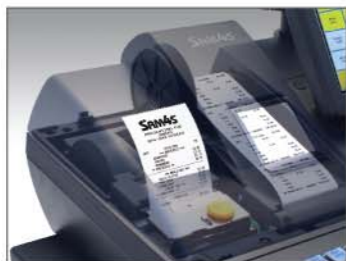
The SPS-500 Series has Magnetic Dallas & (Optional) Mag Card Reader.