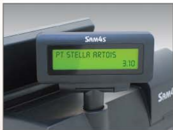
The SPS-500 Series has an adjustable Rear Customer Display.

Featuring a hybrid design, Sam4s has combined fast and simple ECR keyboard entry with an intuitive touch screen operator display.