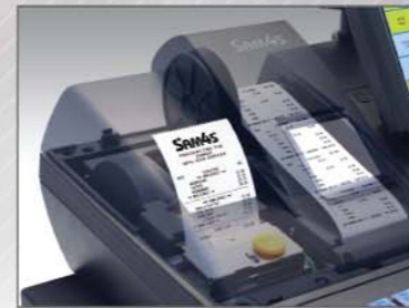
■ The SPS-500 Series has Single & Twin Station Thermal Printers.